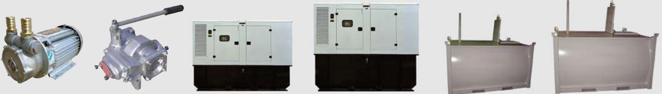
Auto filling fuel pump