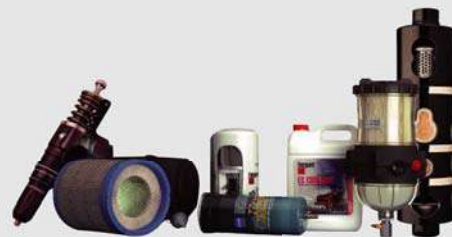
500 hours genset spare parts